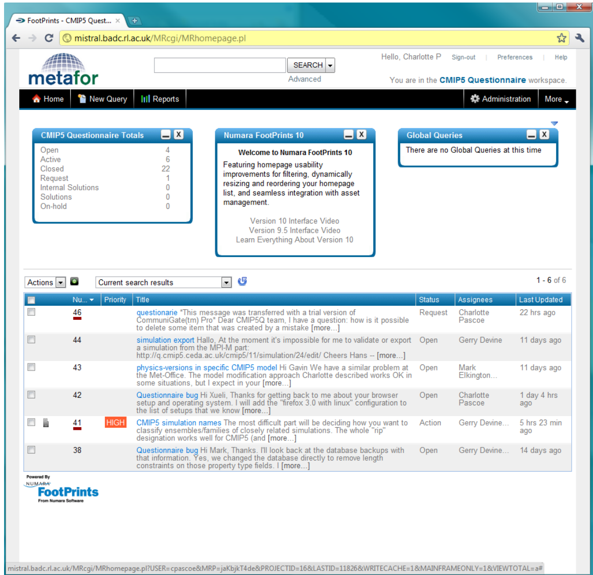
Figure 1: Screenshot of the footprints helpdesk – Queries that have High and Urgent priority settings are highlighted in red. The Title field also displays the last message that was posted to a query, this not only provides useful context but also allows the support team to distinguish queries that have the same name e.g. query 38 and query 42.

certification and the main issuer of these OPEN-ID certificates is the BADC. Therefore the vast majority of queries we receive at the helpdesk are from users who are registered with the BADC. When an email arrives from a registered BADC user their contact details (name, institution etc) are automatically entered into the helpdesk. Our user base is global and we expect to receive queries from users in 15 countries across the globe. The convention for writing names is not the same for all countries and it is not always possible to distinguish a person's first name from their family name in an email correspondence. Therefore it is of particular benefit to have user information delivered directly from the BADC database. Notwithstanding that, the auto-completion of user information also saves time.